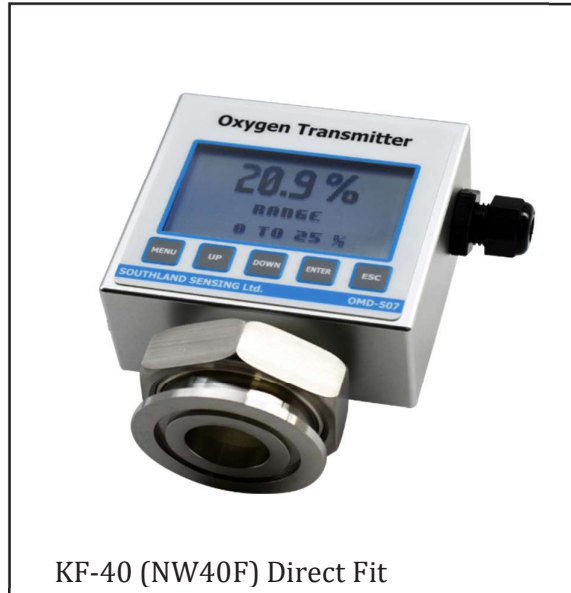
KF-40 (NW40F) Direct Fit